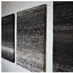
So, I think today's Textile Artist should focus on the recykled fibers, Only then production of new things (including new works of art) is not pointless.